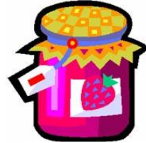
(a jar of jam)